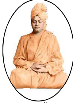
RthÄ $ Ént fhd a j ®

nj h%w«: 17.02.1836 nj h%w«: 22.12.1853 nj h%w«: 12.01.1863 rkhâ : 16.08.1886 rkhâ : 21.07.1920 rkhâ : 04.07.1902