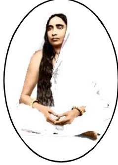
m< i d $ rhuj hnj É