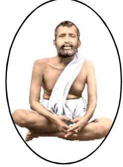
gftk $ uhk»UZ z ®