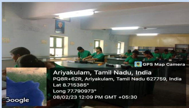
Doing experiment in Physics lab on 08.02.23