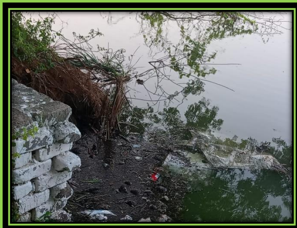
Integrated waste water fish farming