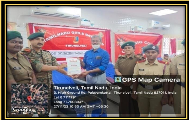
NCC @75: Blood Donation Drive at Government Medical College, Tirunelveli on 27.11.2023