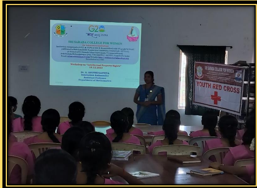
Workshop on “Intellectual Property Rights” on 15.12.2023