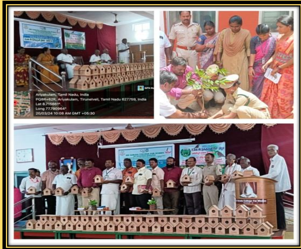
World Sparrow day on 20.03.2024