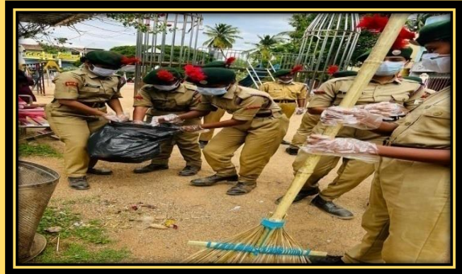
SWACHH BHARAT ABHIYAN at VOC ground 02.10.2023