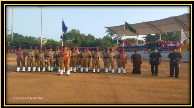
Republic Day Celebration at VOC ground on 26.01.2024