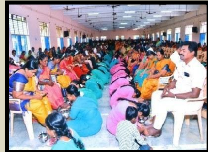
Glimpses of Parents and Children- Poda Pooja on 05.05.23