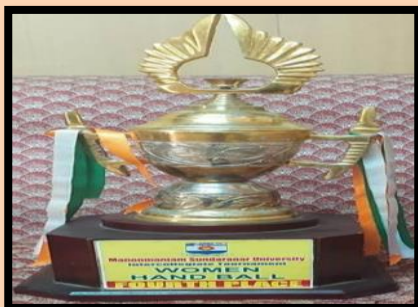
Intercollegiate tournament for Women Hand ball – Fourth Place