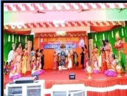
Students Performance in College Day Celebration on 31.03.23