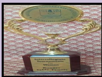
Intercollegiate tournament for Women Runner – Table Tennis